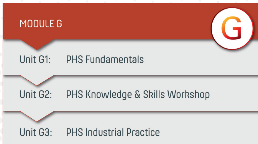
Figure 1: Line-up of learning units of Intensive Training in Press Hardening Module G

The training contents are divided into 3 topical units (see figure 1), consequently following a conceptual path from fundamentals to industrial practice. In advance, an introductory part has to be prepared at home by a new textbook for professional development on press hardening which will be provided to each participant several weeks before the training. The knowledge & skills workshop repeats and deepens the information obtained by the textbook and the units in a playful way.